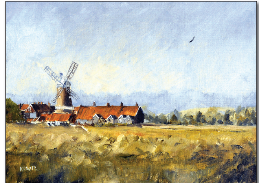
'Cley Mill from the Marshes', oil. Exhibited at the seventh exhibition