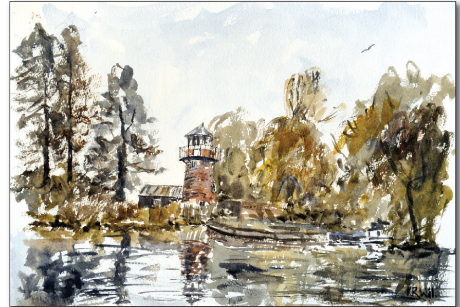
'Broadland Lookout', watercolour, painted 'live' for Dutch, French and Russian TV, November 2011